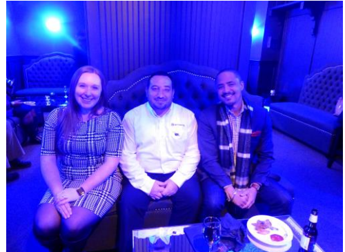
Seasonal Celebration Sugar and Smoke