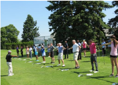
Golf Clinic Bob O'Connor Golf Course at Schenley Park